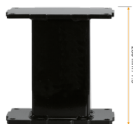
Extender for height adjustable aluminum columns in different versions